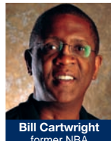
Bill Cartwright former NBA Player/coach