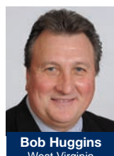
Bob Huggins West Virginia

(Speakers Subject To Change Due To Unforeseen Circumstances) All sessions will be held at Creighton University's D.J. Sokol Arena - on the court with players